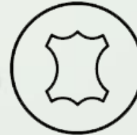
Leather / Fur