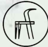
Furniture / Home Decoration