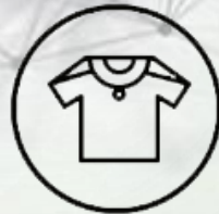
Fashion / Textile